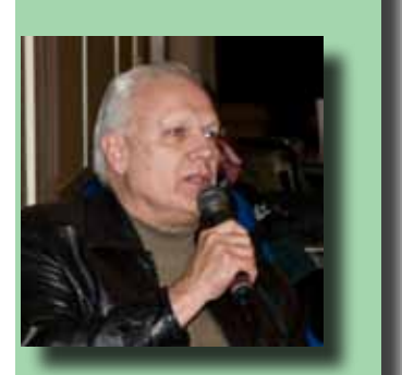
Duane queries the panel

Flash Diffuser Need to soften the harsh light of a flash? Michael Sue suggested that you drape a single ply tissue over the flash & shoot away.